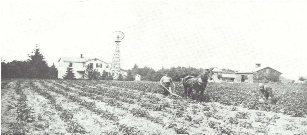
How to Find Old Time Irondequoit – Newspaper

1. How is the land in Irondequoit being used in this photograph?