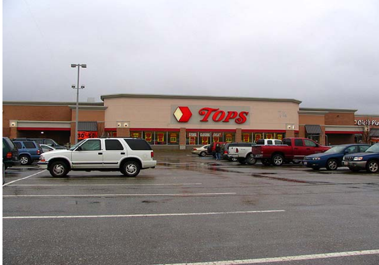
Tops Food Market

3. How is the land in Irondequoit being used in these photographs?