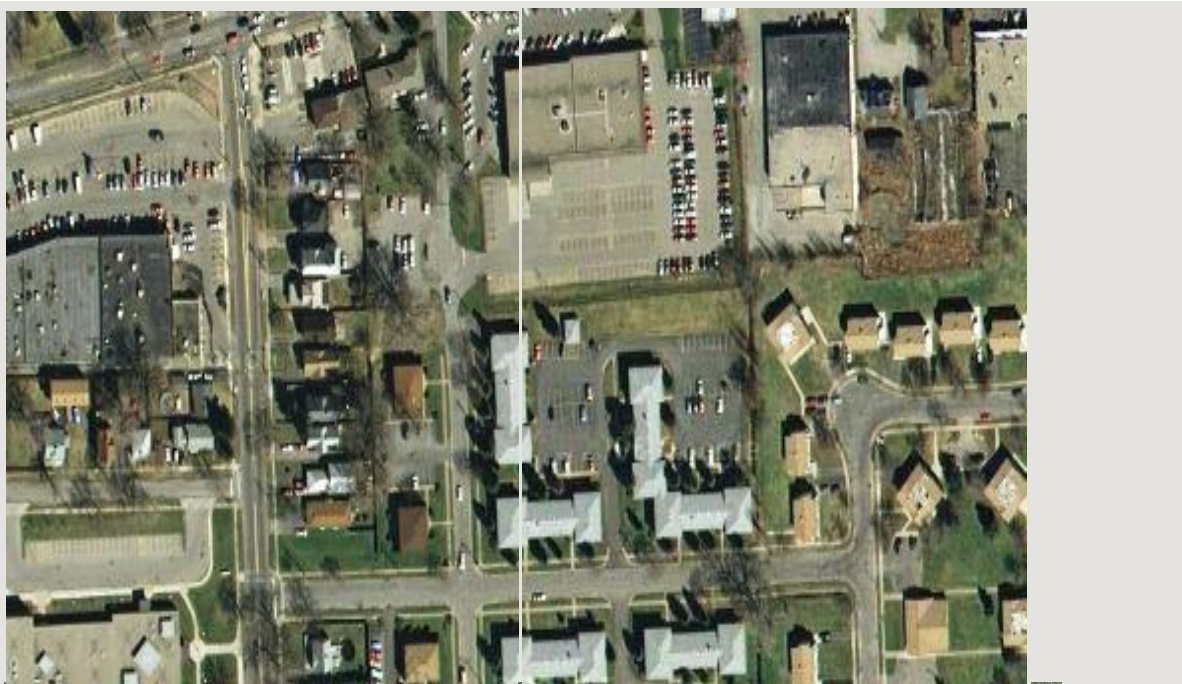
Aerial view of 501 East Ridge Road today, a suburban community.

7. According to this picture, what kind of community is Irondequoit today?