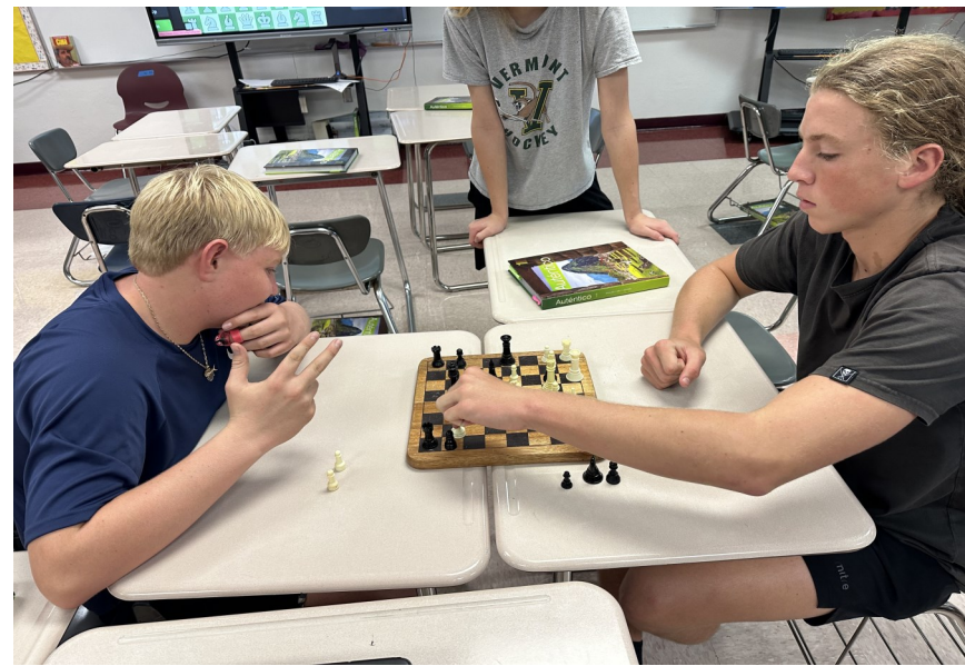
Chess Club enjoying their time together!! These kids are really good and at the same time, willing to teach a peer!

Chess Club meets Mondays and Thursdays in room 4-115 afterschool!! Come join a great club!!