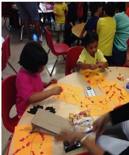
Pre-K is fun!

To register visit the Early Learning Coalition of Miami-Dade/Monroe online at: www.elcmdm.org . Log on to learn more about VPK. You can register on-line or at one of the Early Learning Coalition offices in the lower, middle, or upper keys to receive a VPK certificate of eligibility. Then bring your certificate of eligibility to a public school near you to enroll.