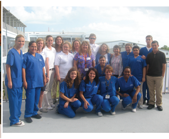
Health Career students at work and the students stop for a group shot.