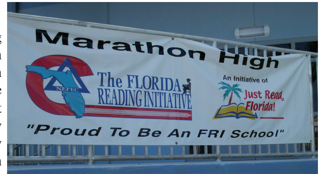
Banner displayed outside our school.

The Florida Reading Initiative is a state research based reading instruction program. How did we become a FRI school? Last spring, 85% of the faculty voted to attend a five day training and complete an online course in teaching reading in all subjects.